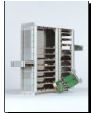
8 slots signal conditioner chassis