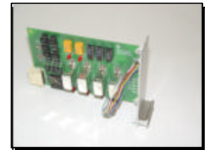
Bus extender card