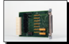
A/D extender card