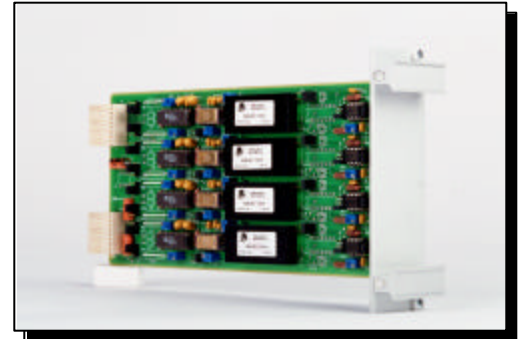
Quad AC/DC Signal Conditioner